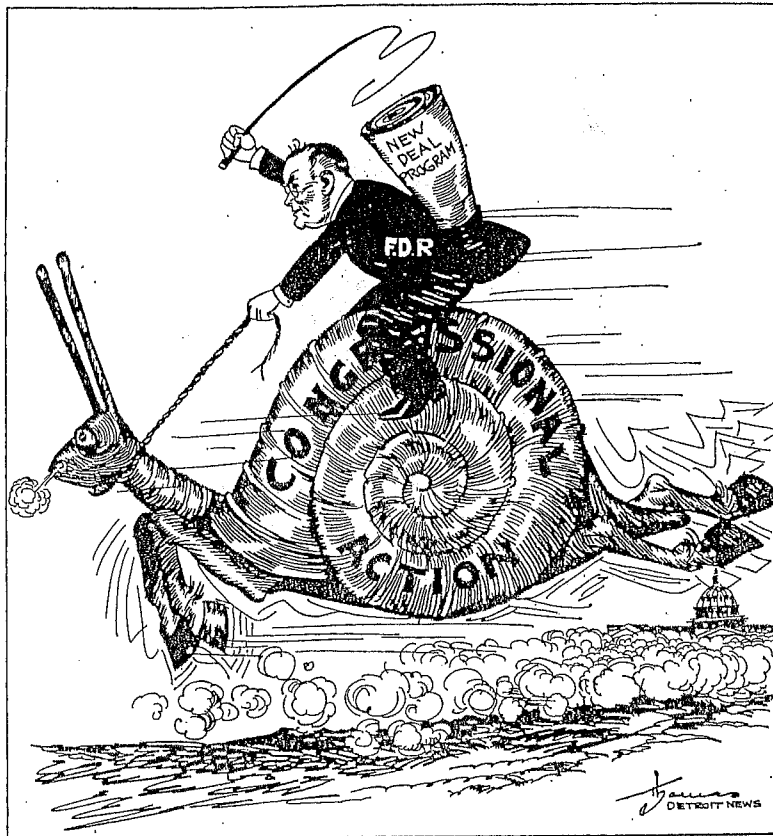
THE GALLOPING SNAIL